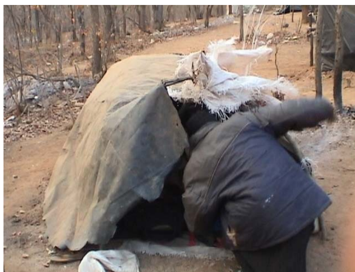
Photo 17: Home for two: this makeshift dwelling is where two people, displaced from Bulawayo after their backyard dwellings were destroyed, now live.