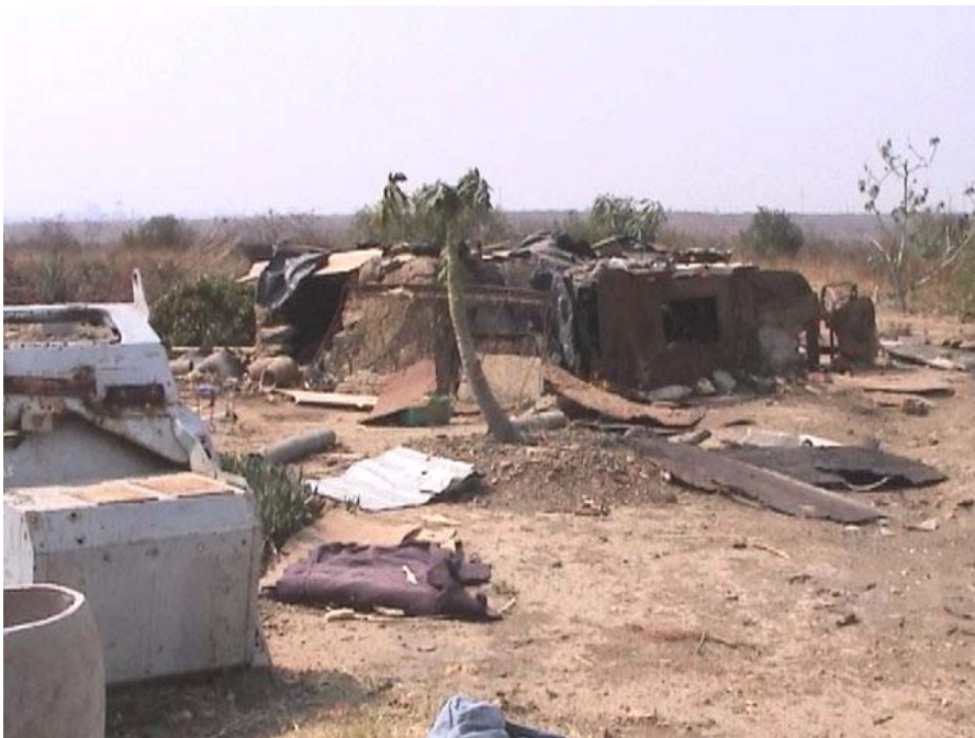
Photo 4: This is not a demolished home – but a carefully reconstructed home, kept to grass-height. A family of three lives here.

This is an exhausting and desperate game, and one that has already cost innocent lives. The terrible fear of the current authors is that if an immediate halt is not brought to this process, innocent people will be ground relentlessly down into ever more desperate poverty, as, for the destitute who have been cast away without resources, hunger turns to starvation.