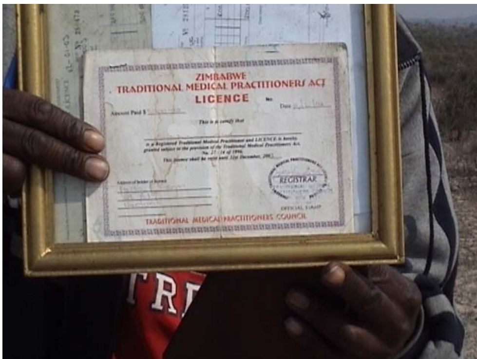
Photo 22: His practising licence is all that remains from his Porta Farm surgery, which was demolished along with his wife's shop and their four-roomed home