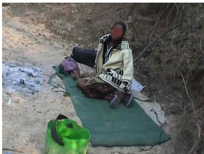
Photo 16: Home for one: this displaced woman, now vending in a mining community, lives right here in the open with all her worldly possessions.

Interview three: a 38-year old woman, separated from her husband, she has two children. She was forced to demolish her tuckshop and was left with no income in Bulawayo. She made her way to this mining community after she heard that it was possible to do business there. She says she is battling to earn enough money in this place, especially since the police recently looted all the goods she was hoping to sell. But she does not consider it an option to return home, because there is no way of earning a living now in Bulawayo either.