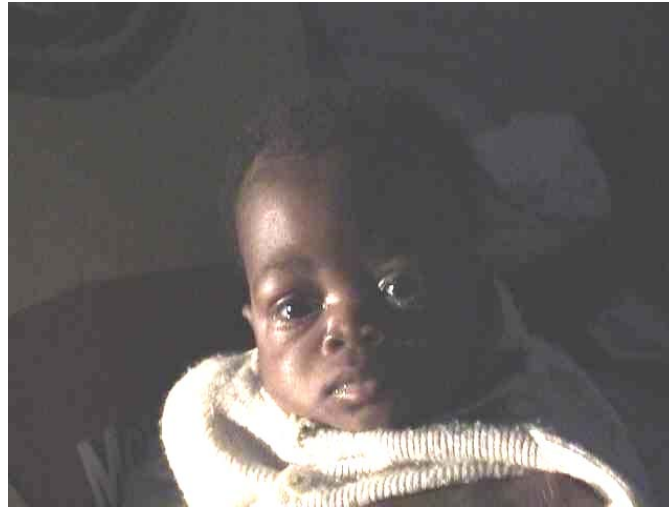
Photo 11: This baby has lived in seven different places in his three months of life.