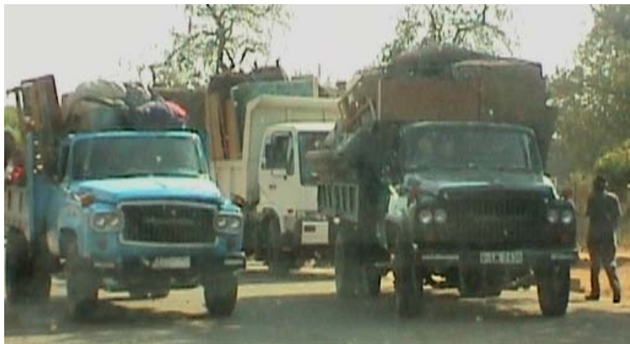
Photos 23 and 24: Victoria Falls: a town on the move, as plans to truck 4,000 people back to rural areas are implemented in early September 2005.

Two weeks later, the interviewee had multiple lesions and swellings on his legs, consistent with dog bites.