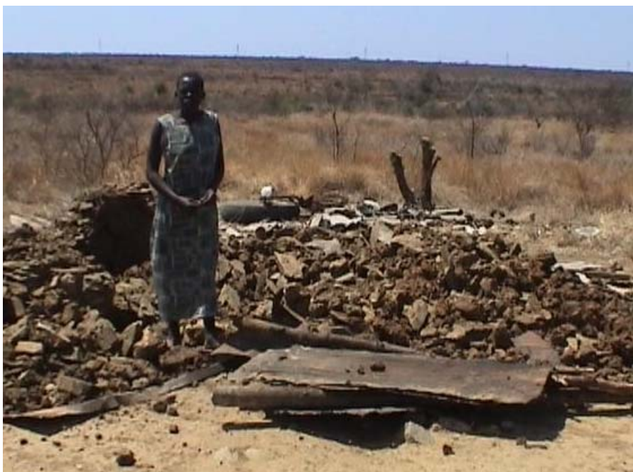
Photo 7: this woman had her home knocked down in Killarney – twice. Her first home was destroyed on 11 June, this one on 29 September 2005.

How to facilitate people having the right to choose where they live is not primarily the churches' problem – this is an issue for the nation.