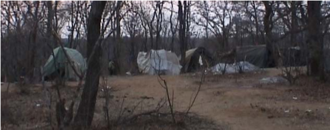
Photo 18: Home for fifty: informal mining settlement somewhere in rural Matabeleland