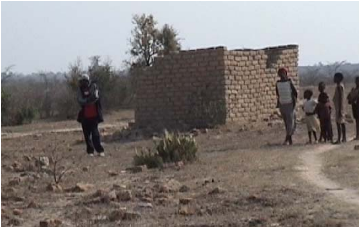
Photo 21: Traditional healer and five of his seven children, displaced from Porta Farm near Harare, start again in this ruined hut in the Midlands.