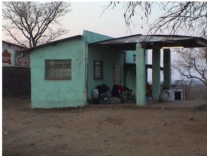
Photos 12 and 13: Another day bleak day begins for this family of five, living in the open in a rural business centre, in mid August 2005.