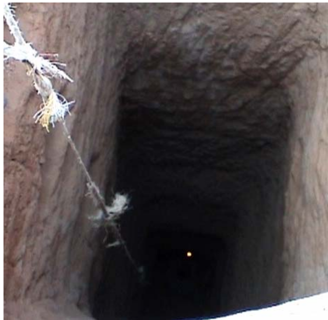
Photos 19 and 20: Down a frayed rope into the bowels of the earth: this mining community has become refuge to several displaced persons, but it is dangerous and precarious work