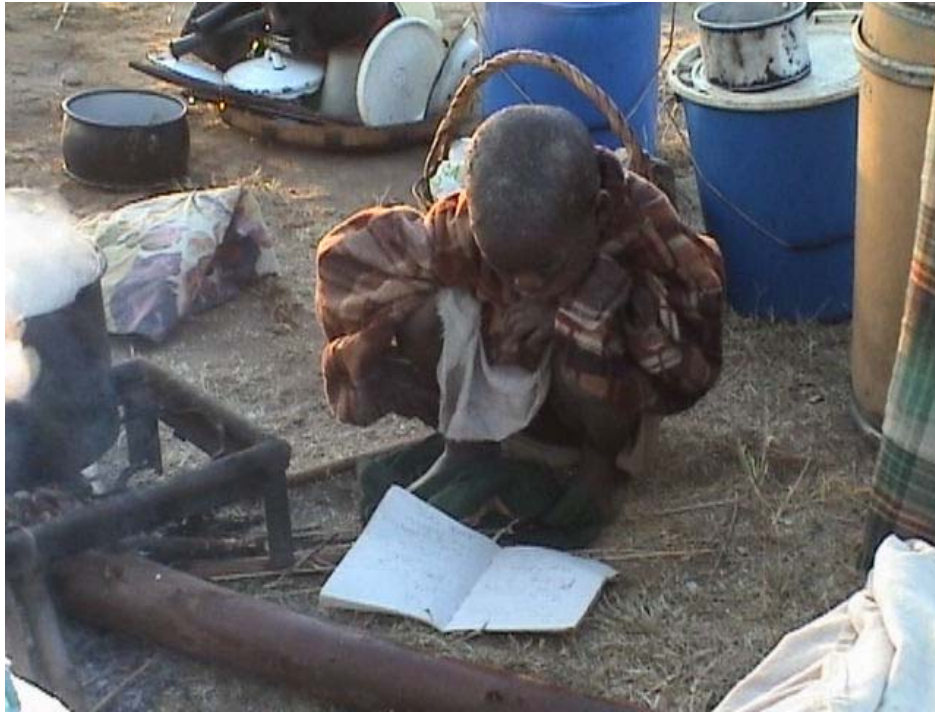
Photo 5: this small boy reads while the houses around him are in flames [Porta Farm, August 2005]