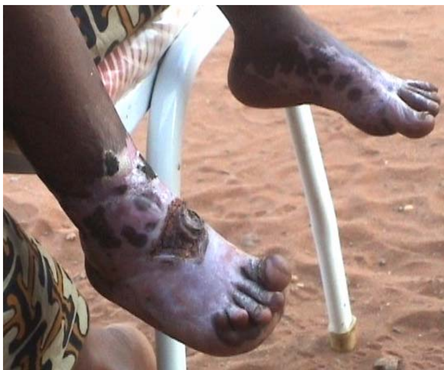
Photo 3: This two year old fell into the ashes of a burning home during OM in Victoria Falls on 2 June. In late September his feet were still bleeding and he was unable to walk. His mother wept as she related their ordeal [see “situation ten” ahead in this report].

Starvation with dignity is the government’s choice – but unfortunately it is not the government ministers making these decisions who will face great hunger and possibly death – it is the poorest and most destitute of Zimbabweans, including small children and the ill and the old, who remain in desperate need of shelter, health care and other support after OM, and many of whom have been hidden away in remote rural areas, out of the eyes of those in the cities.