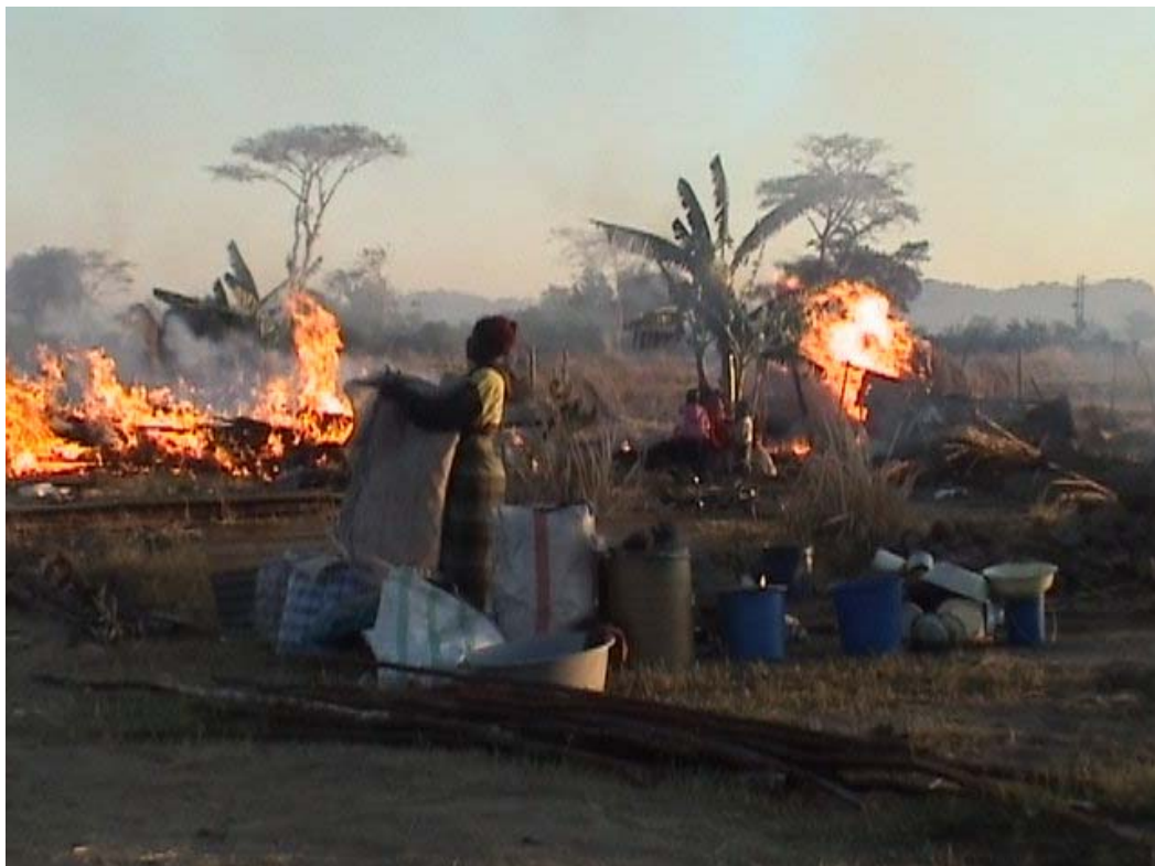
Photo 6: salvaging possessions and preparing to move on – again. [Porta Farm, August 2005]