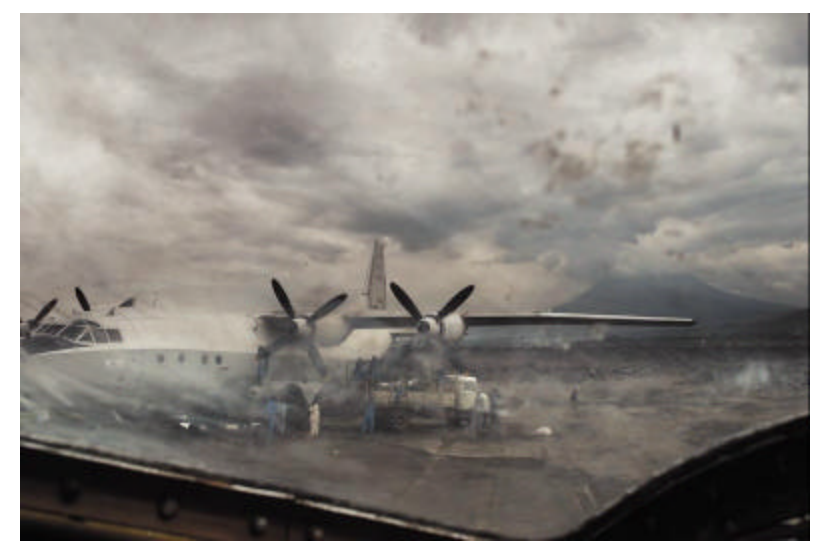
An Antonov 12 operated by Uhuru Airlines unloading cargo at Goma airport in September 2003

The Russian owner of Volga Atlantic, Yuri Sidorov, who lived in South Africa since the mid 1990s and also operated from Namibia and Swaziland, was convicted in 1997 for violating aviation regulations in Namibia<sup>301</sup> and prohibited from using Namibian airspace in August 2001.<sup>302</sup> Sidorov operated several aircraft that, according to South African officials in 2001, worked closely with the Rwandan government to supply the RCD rebel movement. After securing contracts to fly supplies to the DRC for the South African armed forces serving with MONUC, Volga Atlantic was accused in 2002 and 2003 of irregularities by South African and Ukrainian aviation officials<sup>303</sup> The irregularities included a 30-ton cargo flight from South Africa to Bujumbura and Kigali in December 2003 as part of a series of ten flights that was investigated by the South African authorities.<sup>304</sup> In January 2005, the UN Group of Experts also accused Volga Atlantic of infringing aviation rules.<sup>305</sup>