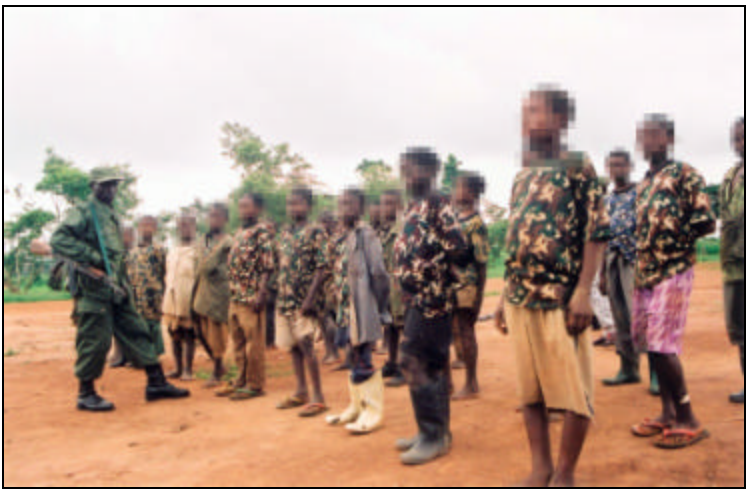
Mayi-Mayi child soldiers undergoing drill at Mangango "Political Retraining Camp", near Beni, Democratic Republic of Congo, July 2003.

Military commanders seek out the children because they are plentiful, vulnerable, easily manipulated and often unaware of the dangers they face. Provided with weapons but with only minimal training in their use, the children often pose as much a danger to themselves as to others.