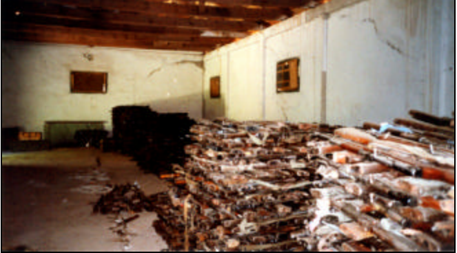
An arms deposit near Tirana, Albania 2003.

It is not clear, however, who paid for the Albanian arms or how much they cost. Albania appears to receive income from the sale of surplus stock as well as international donor funds to collect, safeguard and destroy surplus arms (see box below). Albanian officials told Amnesty International that their government is trying to modernize its armed forces by selling off or scrapping its outdated military equipment, much of it Chinese and Russian, but also comprising small arms and ammunition that have been locally made. The arsenal dates from the 1950s and 1960s, and not all of it is in working order. The Ministry of Defence of Albania claims that it does not export weapons to countries under UN embargo or involved in regional conflicts. Albania no longer manufactures weapons but appears to manufacture small arms ammunition.<sup>127</sup> The Albanian Ministry of Defence conducts arms exports and imports through MEICO, the only company allowed to trade in weapons. The government told the UN that: ' Verification and authorizations of end-use certificates are conducted by our embassies in receiving countries. The identification of end-users is always requested and verified by the embassy... Arms and ammunition are only transported by the army under secure conditions."<sup>128</sup>