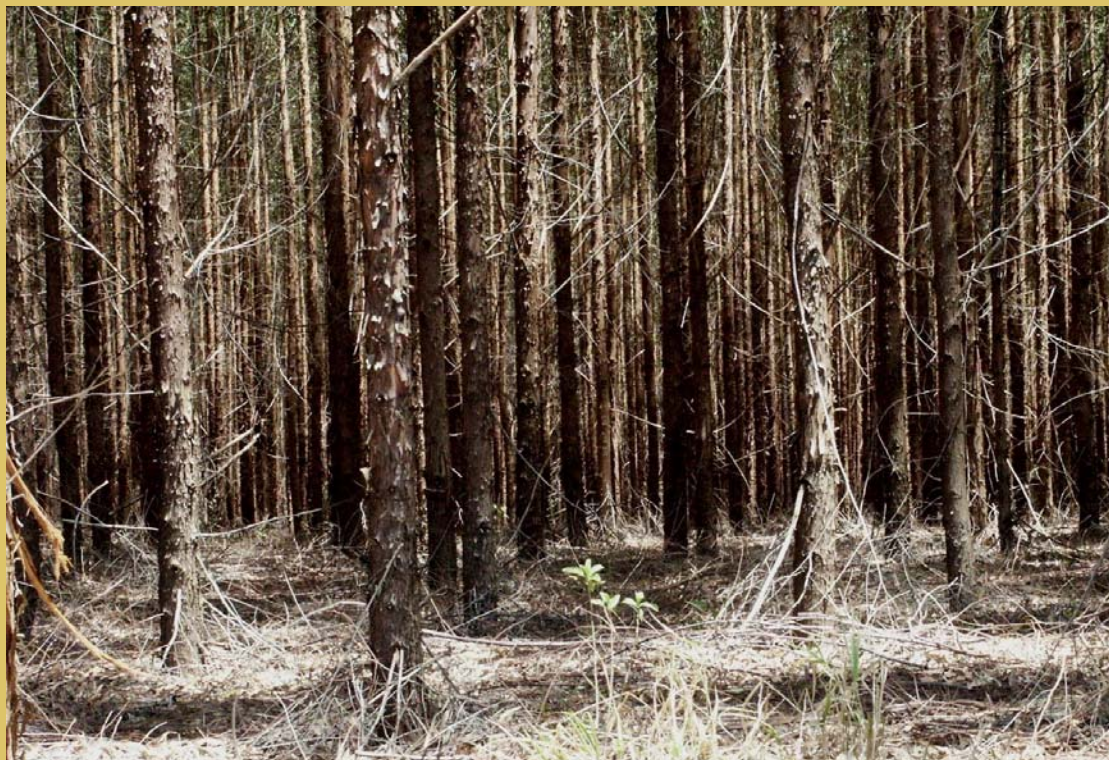
The World Bank supported Plantar Plantation in Minas Gerais, Brazil, has been certified by the Forest Stewardship Council (see chapter on the World Bank and Carbon Finance for a critique of plantar)

In the Forests Strategy, the Bank suggested that an expert in certification should be included in any Advisory Panel that would be required under all 'Environmental Category A' forestry projects. However, as noted elsewhere in this report, the Bank has substantially weakened the panel, and has avoided the requirement for certification, either by downgrading controversial forestry projects to 'Environmental Category B', or by including forest sector interventions within Structural Adjustment Credits which are not subject to the Forests Policy.