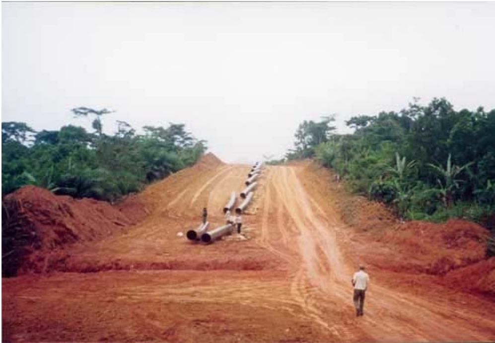
The Chad-Cameroon oil pipeline: destruction of the rainforest.

Under the Natural Habitats Policy (OP 4.04 and BP 4.04), a series of derogations allows the Bank to support projects that will damage 'critical' natural habitats subject to the following conditions: