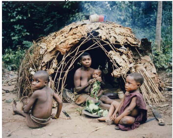
The Batwa, Mbuti and Baka 'Pygmies' of the Congo Basin are entirely dependent on the forest for their survival

likely to be even lower than the national average.