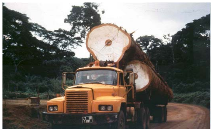
Logging trucks in Cameroon

According to the Forest Strategy, MIGA would have a larger role in forests through its ability to insure private investors against political and catastrophic risk. 64 This naturally begs the question of how the Bank's central goal of poverty reduction through sustainable forest management can ever be reconciled with support for this type of high risk forestry investment, where private sector risk is cushioned by the public purse while forest-dependent peoples and ecosystems are bearing the cost for ill-conceived schemes.