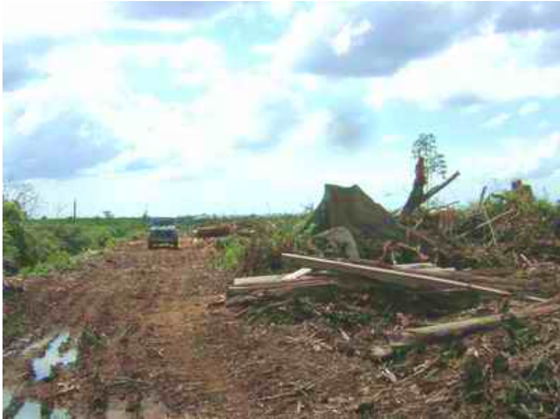
An approximately six-month old land clearing site in the Jatim Perkasa Jaya concession. A clear case of conversion of natural forest