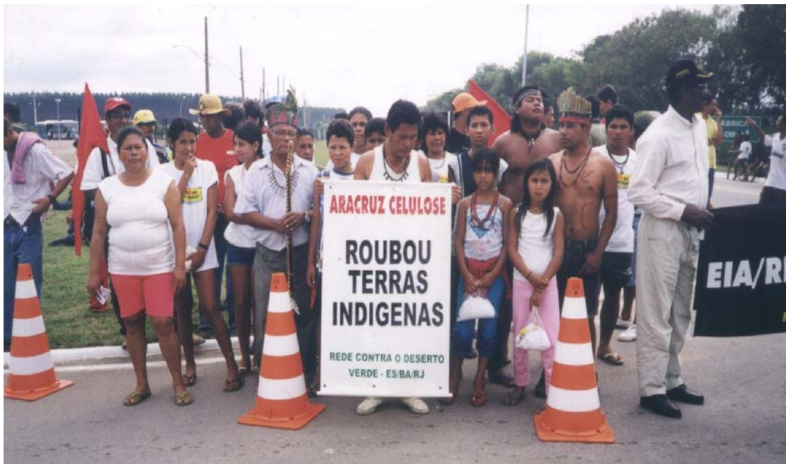
Tupinikim Indigenous People demonstrating against Aracruz Celulose in Brazil in 2002, declaring that "Aracruz Celulose has stolen Indigenous Lands"

Cover Photo: Plantar plantation, Brazil