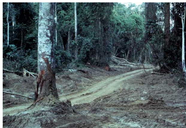
Road in clear-cut in Cameroon

paragraphs on 'Poverty and Social Impacts' and 'Environmental, Forests and other Natural Resource Aspects' of OP 8.60 state that the Bank will determine if there is going to be significant impact on the environment, the poor and forests and assess the borrowers' systems to address those impacts. If those systems have gaps, then the Bank commits itself to describing them. 87 In other words, the Bank is not obliged to take action when its own lending hurts the poor, degrades the environment and devastates forests.