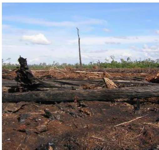
Recent intentional burning of a land clearing site in JPJ plantation, just beside the employee housing barracks

the IFC Board announced in May 2004 that the US$ 33.3 million guarantee for Wilmar had been approved.