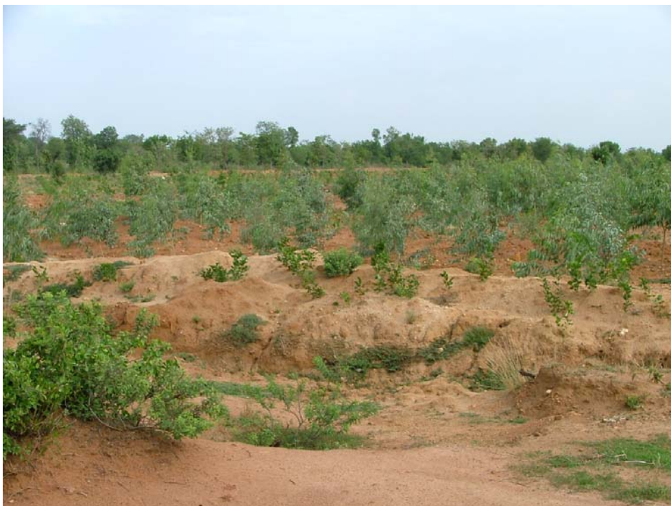
Unwanted eucalyptus plantation on VSS land in Andhra Pradesh. Protests by villagers against the plantation and requests to plant a mix of native species and fruit trees were rejected by the Forest Department, which threatened the VSS with exclusion from benefits (such as wage work) under the World Bank project unless villagers planted the trees.

decisions set out in VSS resolutions are routinely ignored or dismissed by the APFD, while crucial issues such as land tenure conflicts are not being dealt with under the project. In several villages, the APFD is putting pressure on VSS to enter into contracts with private forestry and pulp firms to establish plantations of eucalyptus and teak on VSS land against the wishes of the VSS and community members. VSS members that dare to challenge the Forest Department instructions are threatened with legal sanction and/or exclusion from project benefits. Project benefits for villagers have been confined to occasional and temporary wage labour for the APFD. It turns out that the "community forest management" component of the project is narrowly restricted to the preparation of microplans for village development and VSS forest management "treatments". Most of these plans are being drawn up by APFD staff and are considered sub-plans of the government's own forest plans.