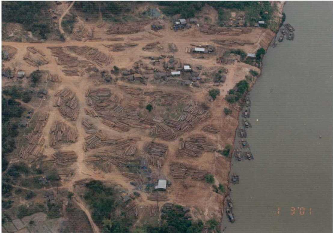
Log rest area at the Mekong River in Cambodia

Criticism over several years has not wrought substantive changes to the Bank's approach in Cambodia. There are signs that some within the Bank recognise that serious mistakes have been made. Crucially, however, senior staff have so far declined to face up to the shortcomings and rectify the damage caused. In February this year a group of Cambodians, supported by NGOs, submitted a complaint to the World Bank's Inspection Panel,