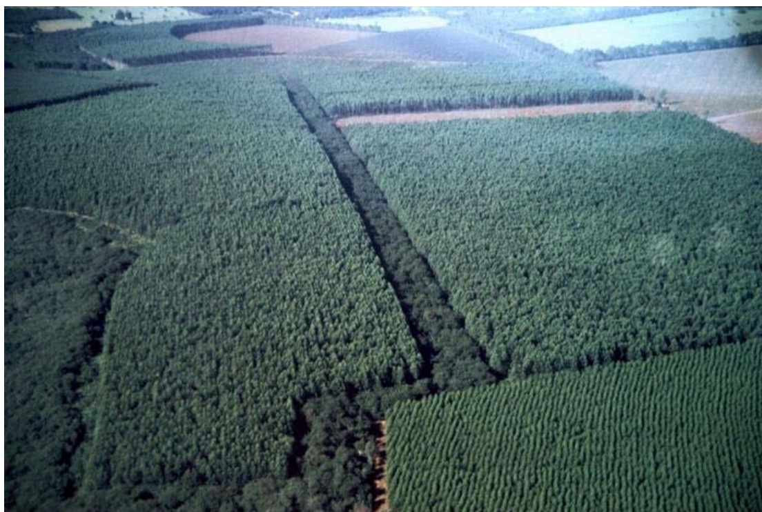
Plantar plantation covering a large area of cerrado landscape in Minas Gerais, Brazil

like Plantar, which are based on industrial wood production. Yet in the current carbon market, projects of the type being developed by the BCF will provide little more than a cover picture for the BCF annual report given the high costs and the tiny volumes of carbon credits these projects will generate. The small volumes also render them a largely irrelevant response to climate change as long as they justify additional fossil carbon releases.