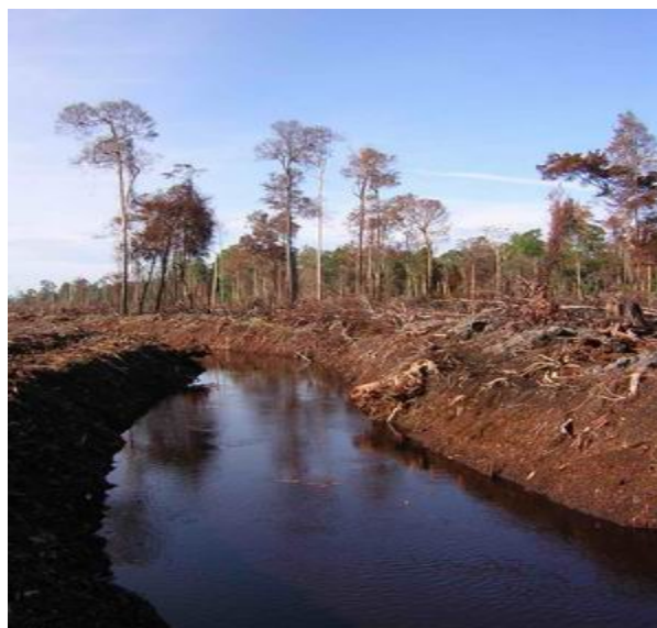
Western border of the JPJ concession area. Canal construction by the company.

A case in point is the IFC's pre-shipment financial support for the Singaporean company Wilmar Trading. 40 The Wilmar Group is the biggest crude oil palm refiner and exporter in Indonesia. It owns four CPO refineries in Indonesia and another in Malaysia, with a total production of 3.3 million tonnes/year. It has investments in at least 85,000ha of oil palm plantations, but buys some 90% of its supplies from Indonesian producers belonging to other conglomerates. 41