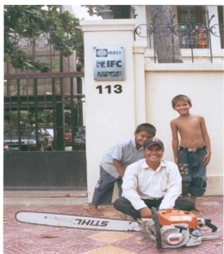
Outside the World Bank offices in Phnom Penh

The Bank launched the US$ 5 million FCMCPP in 2000 with the aim of reforming Cambodia's concession system through technical assistance to the Forest Administration and the logging concessionaires. The FCMCPP tied in with a US$ 30 million Structural Adjustment Credit (SAC) to Cambodia. The Bank made the release of the second US$ 15 million tranche of this loan conditional on progress in forest sector reform.