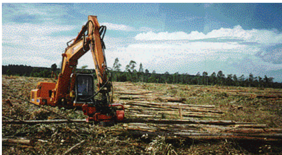
A processor debranching and cutting eucalyptus on an Aracruz plantation