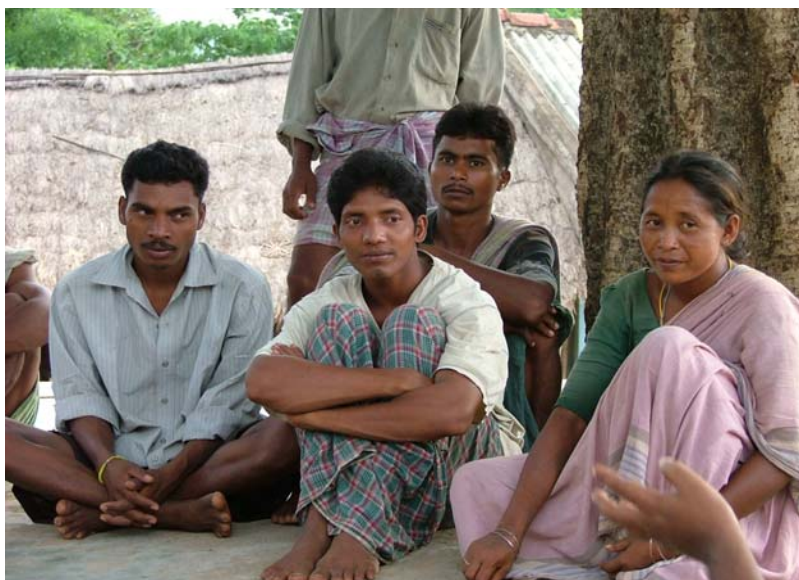
Members of community VSS in Andhra Pradesh complain that key documents relating to the World Bank-funded forestry project such as the Tribal Development Strategy and even their own village microplans are not readily available to VSS members and other villagers

In addition, there are severe criticisms of the Tribal Development Strategy (TDS) financed under the project, which was drawn up by outsiders with no prior agreement and little knowledge by Adivasi leaders. Villagers talked to as part of the evaluation said they had never seen the final document and were unaware of its budget or its objectives. On being told of its contents, leaders affirm that they strongly reject the stated ‘underlying philosophy of the tribal component’, which is “ to reduce the dependence of the tribals on the forests for their economic subsistence ” (through provision of wage employment with the forest department and alternative market-based income alternatives).