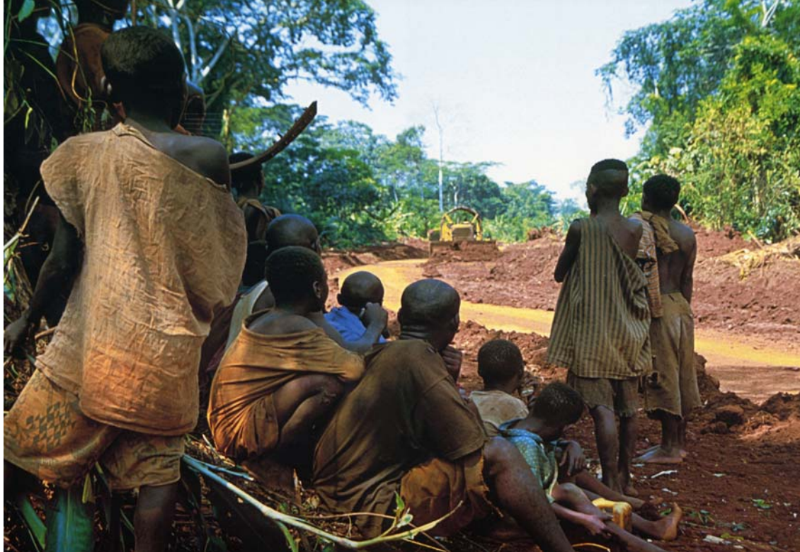
The expansion of industrial logging in the Congo Basin under the guidance of the World Bank threatens the livelihoods of some of the poorest people on earth

have so dismally failed in other parts of the world.