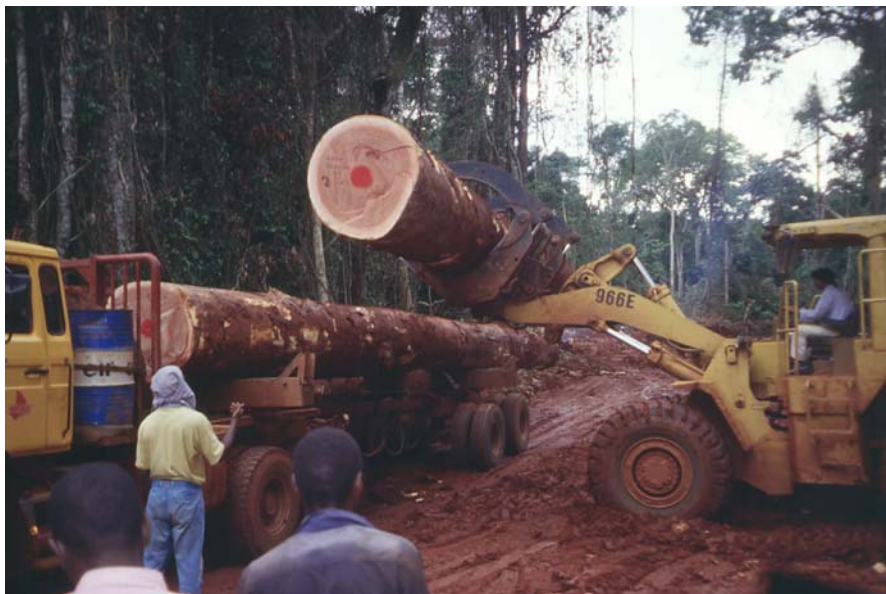
Logging Trucks in Cameroon

policy. Is it being applied effectively? Does it actually protect biodiversity and critical ecosystems? No one really knows.