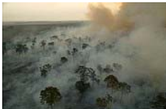
Brazilian rainforest being burned by agricultural giant Cargill to make way for soya crops

The danger of soya expansion generating further damaging encroachment into the rainforest ecosystem has been reiterated by many. 77 WWF has estimated that nearly 22 million ha of forest and savannah land in Latin America could be destroyed by 2020 as a result of soya agriculture.