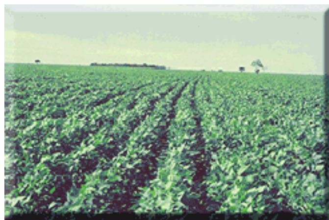
Extensive soya crops in Brazil

and 2003, Brazilian beef export increased fivefold, and that, in 2003, for the first time, growth in Brazilian cattle production – 80% of which is in the Amazon – was export driven.