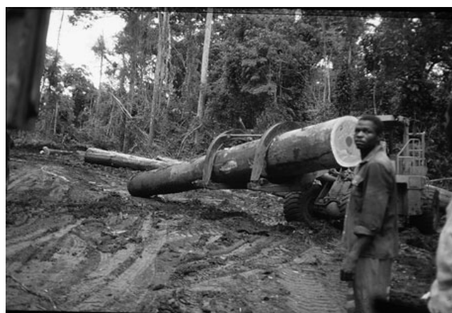
Industrial logging in other Congo Basin countries such as Cameroon and Republic of Congo has had devastating environmental, social and economic impacts

The UN Security Council has also recognised the dangers, and unanimously passed a resolution calling on " States, international financial institutions, and other organizations to assist...in efforts to create appropriate national structures and institutions to control resource exploitation " in DRC. 19 As yet, this has not happened, and there is little prospect of such institutions being established in the foreseeable future.