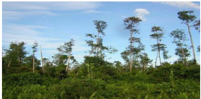
Heavily logged primary forest with reduced canopy cover, typical for the concession area

Bank was heavily involved in 'development' projects throughout the three decades of the Suharto regime. Forestry programmes during the late 1980s and early 90s supported the official forest policy in which over one third of the country's forests was handed over to commercial logging companies while another third was destined for 'conversion' to plantations. 33 Typically, same conglomerates owned both the companies that destroyed the forest by over-logging and the plantation companies that benefit from the land clearance. During the same period, the World Bank helped to finance Indonesia's transmigration programme. Government-sponsored transmigrants and other settlers encouraged through Indonesia's resettlement policy were a readily available source of cheap labour for the nucleus-estate plantation system (PIR). Plantations also benefited from Bank-funded infrastructure projects, including roads. The International Finance Group (IFC) provided at least one loan to an Indonesian company during the 1990s to develop oil palm plantations and CPO mills.