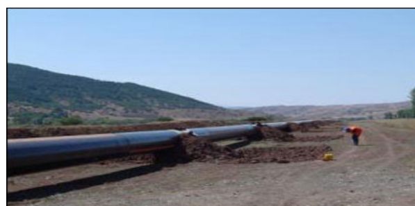
The Baku-Tblisi-Ceyhan Oil pipeline, financed by the IFC.

Today, the Bank is one of the largest public sources of funds for the fossil-fuel industry. From 1992 through late 2004, the World Bank Group approved US$ 11 billion in financing for 128 fossil-fuel extraction projects in 45 countries. These projects will lead to more than 43 billion tons of carbon dioxide emissions, with more than 82% of World Bank financing for oil extraction going to projects that export oil back to countries in the industrialised North. In 2003 alone, the Bank provided US$ 2.5 billion in financing for fossil fuel projects. 93