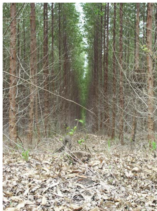
Inside the Plantar plantation. Habitats and livelihoods are lost when grasslands are turned into tree plantations

Given the Bank's historic role in financing and promoting fossil fuel use, it is perhaps unsurprising that it has emerged as one of the most committed champions of using carbon finance to promote tree planting projects – so-called carbon sinks, because trees soak up carbon from the atmosphere. By absorbing carbon emissions in the short term, tree plantations help avert near-term action to reduce carbon emissions at source which would inevitably involve reducing fossil fuel use. Despite the Bank's rhetoric about the PCF being focused on renewable energy projects, the two PCF carbon sinks projects in Brazil and Moldova are claiming a combined total of over six million emission reduction credits – 15% of the credit volume from projects taken forward as of 30 September 2004. Moreover, the Bank has a specialist carbon sinks fund – the BioCarbon Fund (BCF), which is expected to deliver four million carbon credits 96 through approximately 14 small afforestation projects. 97 Critics argue that without the support of the BCF, many of these small projects would be unable to compete in a market where a single large-scale tree plantations project like the PCF's Plantar project will deliver 4.2 million carbon credits – more than the entire portfolio of the BCF combined. The World Bank may also develop more plantations projects through its Community Development Carbon Fund, which was set up to “give carbon a human face”. 98