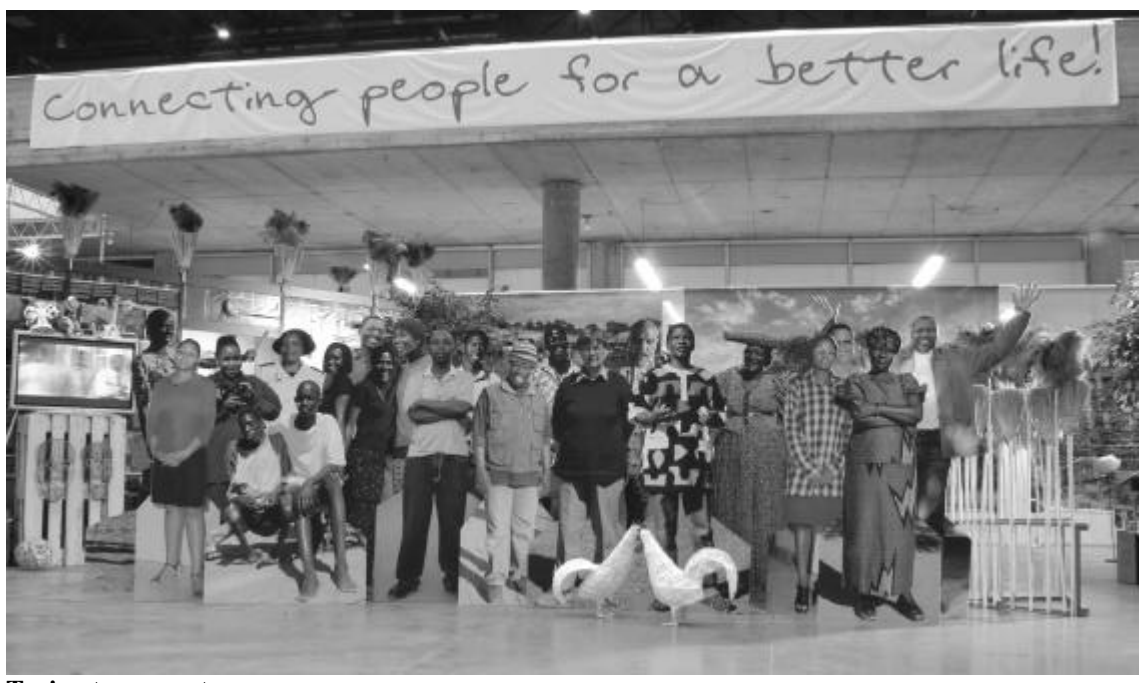
Trying to connect The 20 "Speaking for Ourselves" poster-board cut-outs featured at the African Media Village in Geneva.