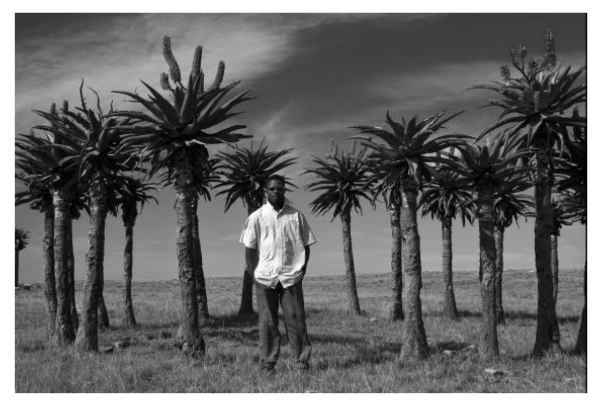
Aloe church, Transkei

A shepherd at a local church/community gathering place, which has been created by planting a circle of aloes on a hill above a village in the Transkei, Eastern Cape, South Africa.