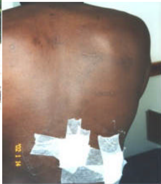
Photos 5 and 6: David Mpala: attacked by war veterans in his rural constituency on 13 th January 2002. Bandage covers two incisions made with a sharp instrument, requiring stitches in a hospital: upper right back reveals scars from beatings with sjamboks by war veterans during the 2000 election campaign..