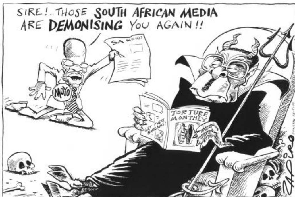
Zapiro© 23 July 2003